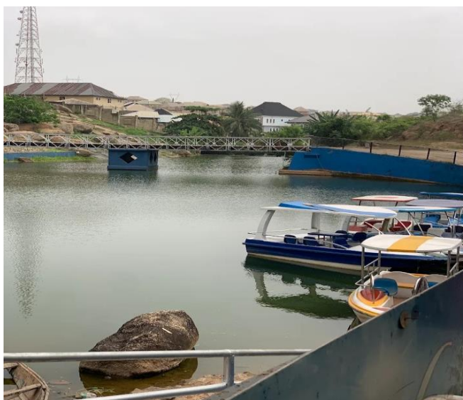
Olusegun Obasanjo Presidential Library And Museum