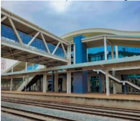
Professor Wole Soyinka Train Station

Today after breakfast participants would be conveyed to the Professor Wole Soyinka train station for check-in and final departure back to Lagos.